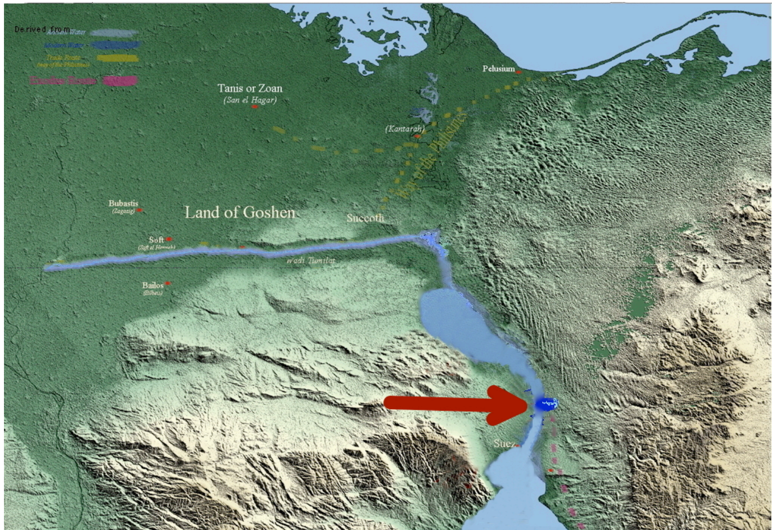
Fig. 18 All the force and volume of the third wave of water hits together from the west and pushes against the high sand river bank to the east.