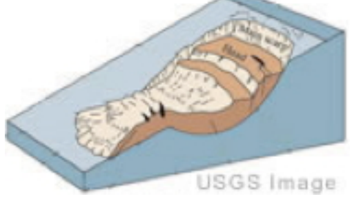
Fig. 16 Below: Undercut river banks, and river bank collapses, are not unusual but rather normal for rivers and inlets. Image shows collapse and full 'TOE' (geomorphology term).