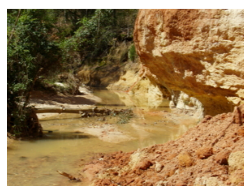
Fig. 15 Left: Undercut sand river bank (Sand River, SC USA) shows effect of current and partial collapse of the bottom. (mirror image)

The wave of waters returns from Great Bitter Lake and Little Bitter Lake to the North, and from the South from the Top of the Gulf of Suez and the area just to the south of the top.